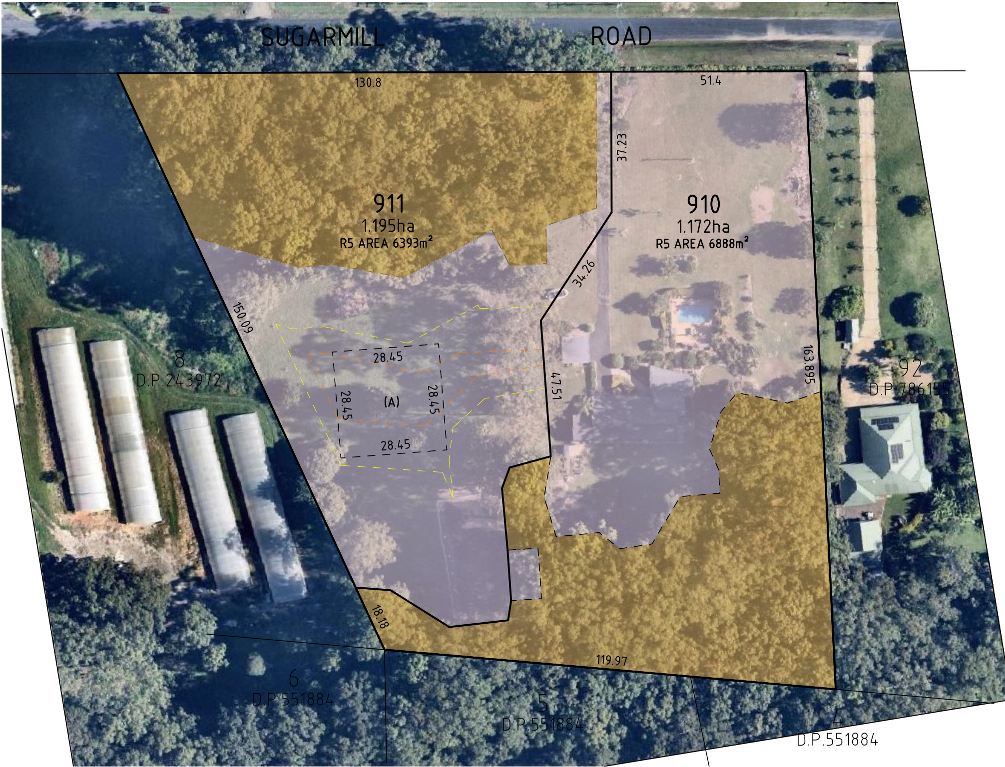
(A) PROPOSED BUILDING ENVELOPE