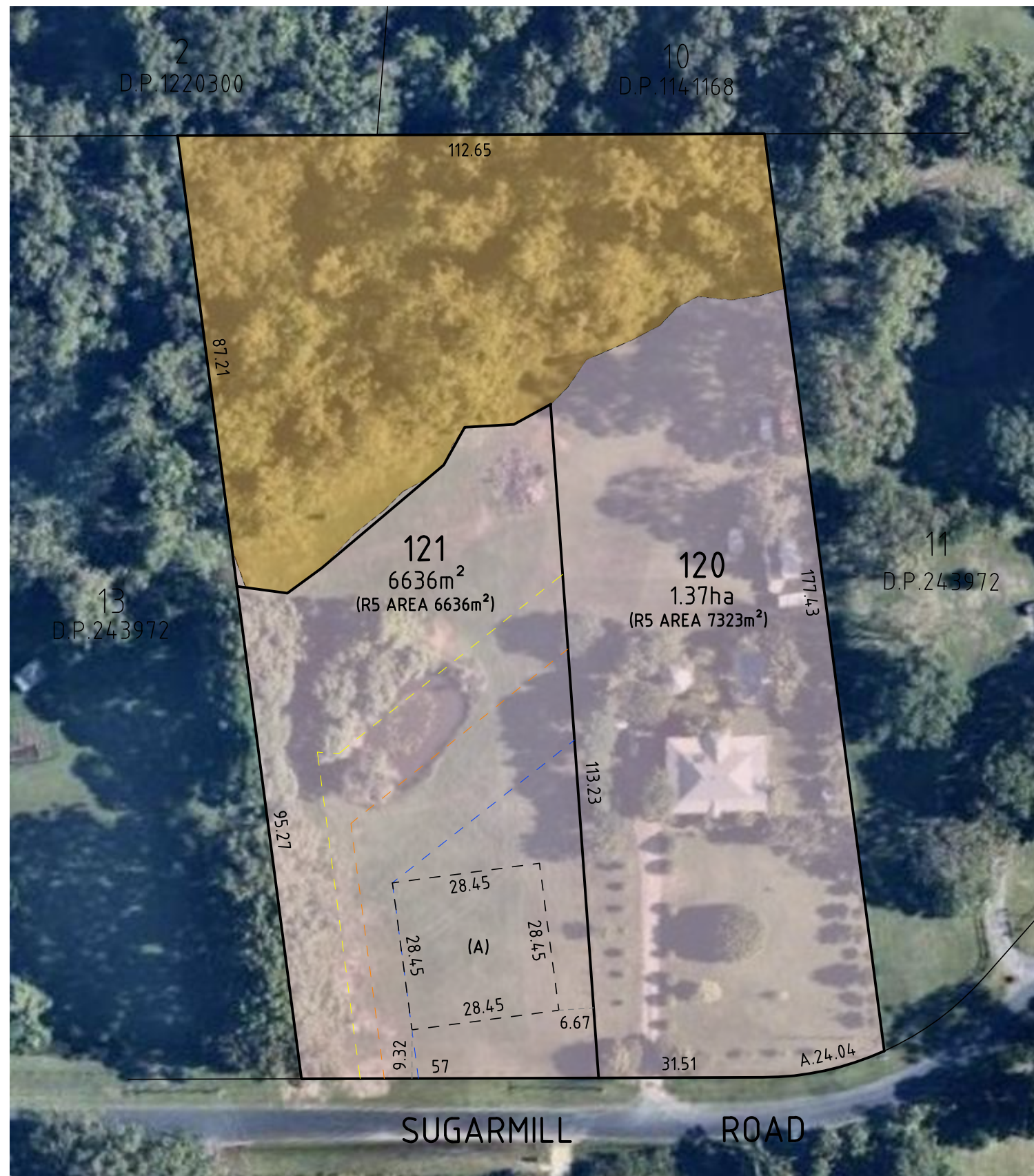
(A) PROPOSED BUILDING ENVELOPE